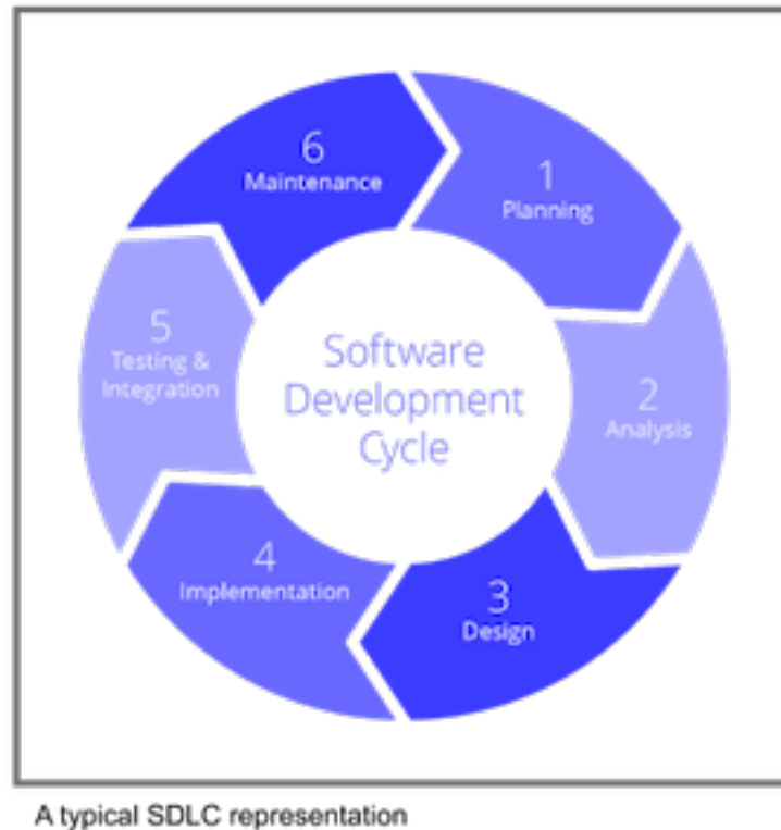
Figure 2: SDLC Diagram

Overview Almost all modern software is developed in an iterative manner passing through phase to phase, such as identifying customer requirements, implementation and test. These phases are revisited in a cyclic manner throughout the lifetime of the application. A generic Software Development LifeCycle (SDLC) is shown below, and in practice there may be more or less phases according to the processes adopted by the business.